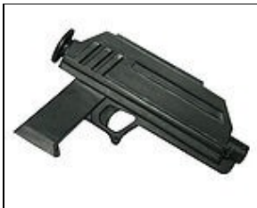
DC-17 Hand Blaster (animated style)