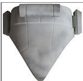
Posterior Armor, Belt rear and Detonator For 501st approval: