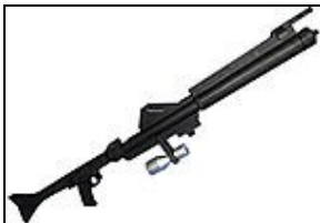
DC-15A Blaster Rifle (animated style)