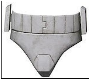
Codpiece and Belt front For 501st approval: