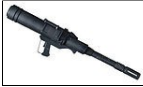
RPS-6 Rocket Launcher For 501st approval:

Manufactured by Merr-Sonn Munitions, Inc, the Z-6 Cannon incorporates a rotary assembly of six barrels, wrapped around a coolant-lined core, providing a tremendous sustained rate of fire. Because it is large and can become unwieldy, the Z-6 is reserved for special-issue deployment and requires training to use effectively.