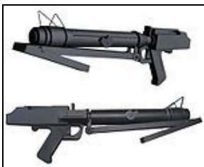
DC-15S Blaster Carbine (animated style)