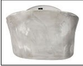
Kidney Armor For 501st approval: