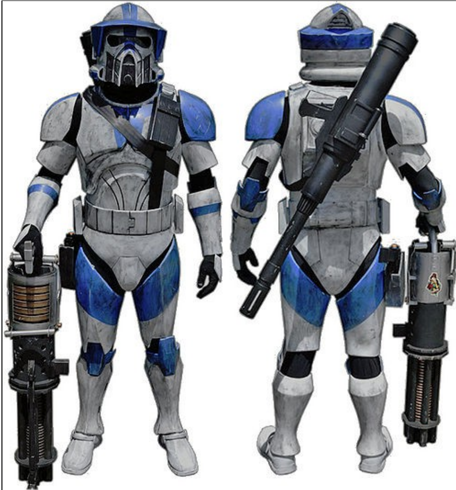
Model CX 5298