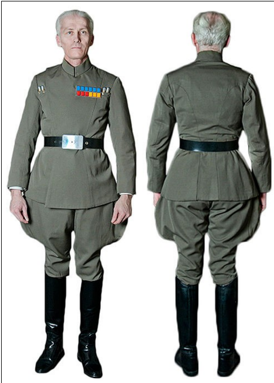
Model ID 784